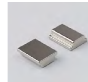
Mounting Magnet UA42407-MAGNET