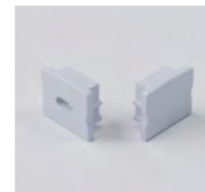
End Cap Set UA38866 - ENDCAPSET