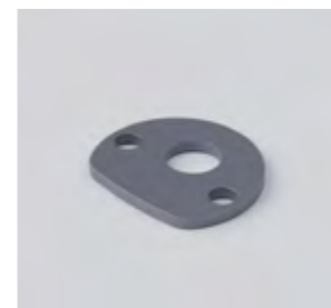
End Cap UA10733