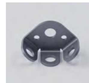
End Cap - Three Way UA12080