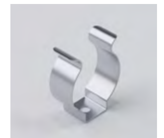
Terry Clip UA10735