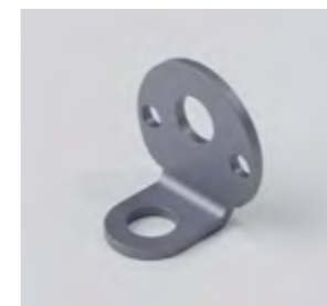
End Cap - One Way UA18036