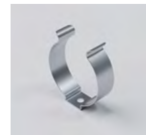
Terry Clip - 28mmØ F-TERRY-28MM