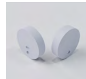
End Cap Set UA40564-ENDCAPSET