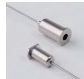
Pendant Mounting Kit UA42408-PENDANT